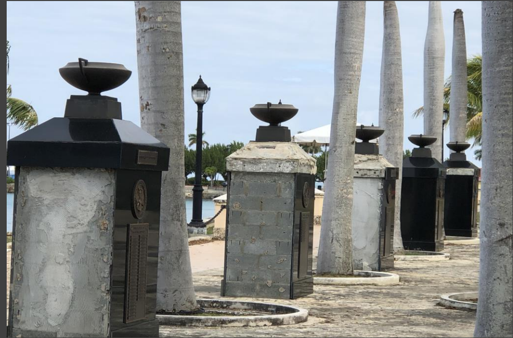
Verne L. Richards Veterans Park.... TODAY